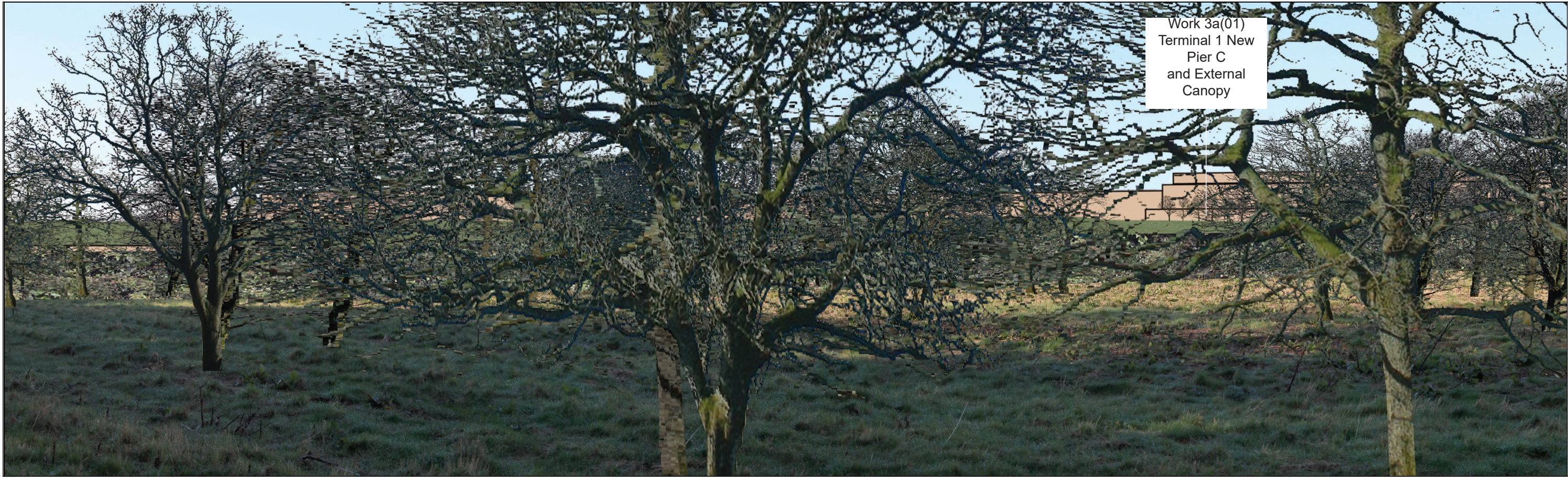
View with proposed planting (Phase 2b)