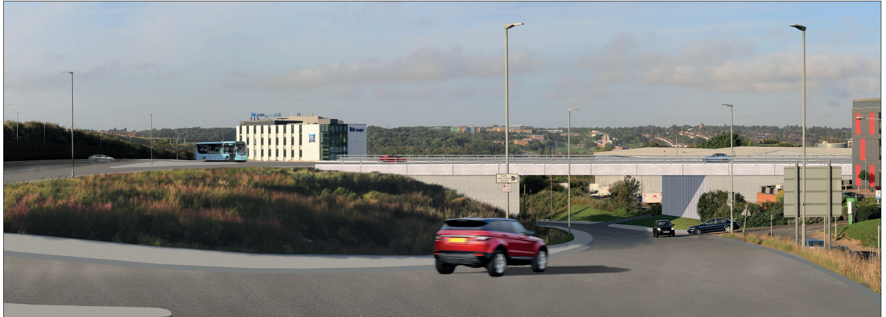
Illustrative photomontage of new Airport Access Road and bridge over Airport Way

Accurate Visual Representation based on winter viewpoint photography. Refer to Appendix 14.6 of this ES [TR020001/APP/5.02] for corresponding viewpoint information.